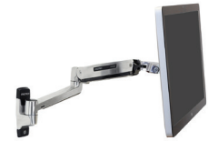
LX HD Sit-Stand Wall Mount LCD Arm