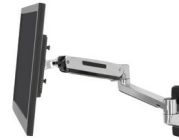
LX Sit-Stand Wall Mount LCD Arm