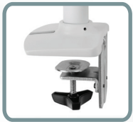
SHOWN WITH WORKFIT-TL SIT-STAND WORKSTATION

INCLUDED: STANDARD 2-PIECE DESK CLAMP ATTACHES TO SURFACE EDGE