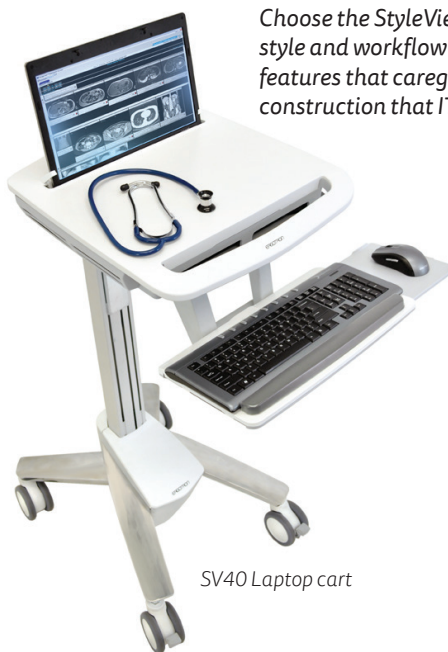
SV40 Laptop cart

Choose the StyleView medical cart that best meets your caregiving needs, style and workflow. Our market-leading StyleView carts include all the features that caregivers ask for, with all the open architecture and quality construction that IT departments require.