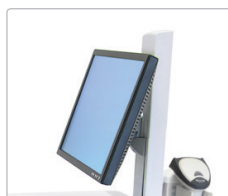
LCD Pivot: #SV40-6300-0