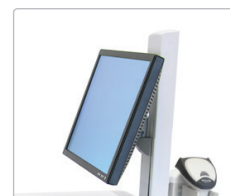
LCD Pivot: #SV40-6300-0