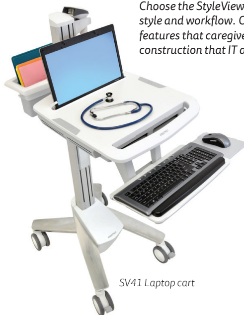
SV41 Laptop cart

Choose the StyleView medical cart that best meets your caregiving needs, style and workflow. Our market-leading StyleView carts include all the features that caregivers ask for, with all the open architecture and quality construction that IT departments require.