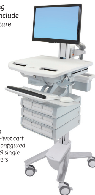
SV43 LCD Pivot cart pre-configured with 9 single drawers