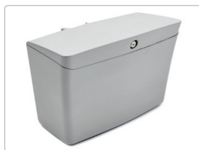
SV Storage Bin