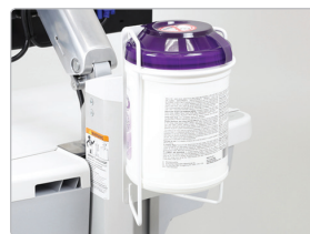
SV Sani-wipes Holder