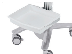
SV Front Tray