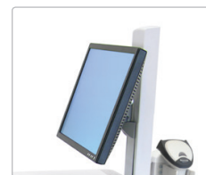
LCD Pivot: #SV43-13X0*-X**

* This number (X) designates various drawer configurations. See ergotron.com for specific part numbers. **Due to regional power requirements, (-X) part numbers vary by country. See ergotron.com for specific part numbers.