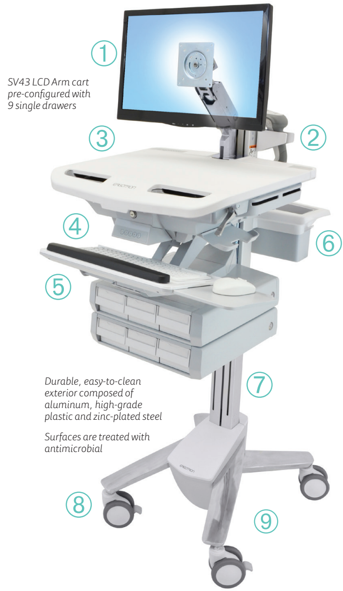
SV43 LCD Arm cart pre-configured with 9 single drawers

Cart also can be fitted with up to three rows of tall drawers.