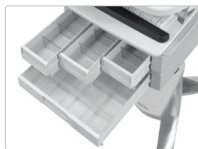
Several drawer configurations