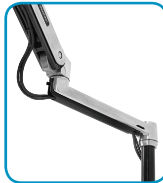
CABLE MANAGEMENT CLIPS ON THE UNDER SIDE OF THE ARM ROUTE AND HIDE CORDS